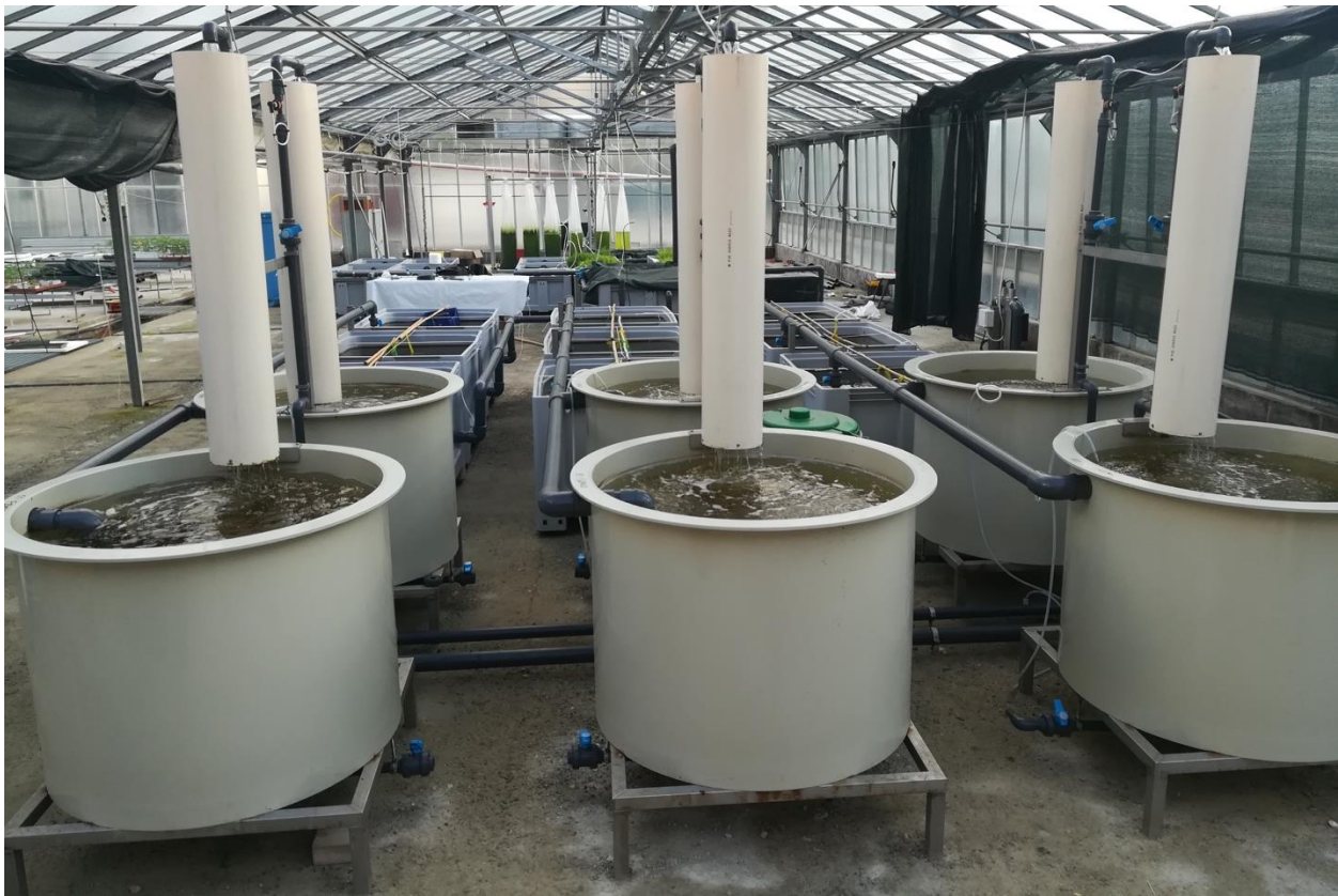
Figure 4: SIMTAP system in operation at University of Pisa in Italy; focus on fish rearing tanks, where the lack of clarity of the water can be noticed.