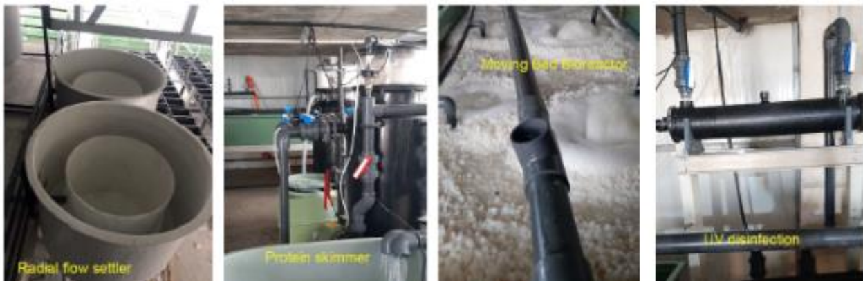
Figure 3: Filtering and treatment equipment of the SIMTAP system implemented at MEDFRI in Turkey.

The system should be also be fitted with a heat pump unit to deal with any extreme water temperatures that the system could face, depending on the location.