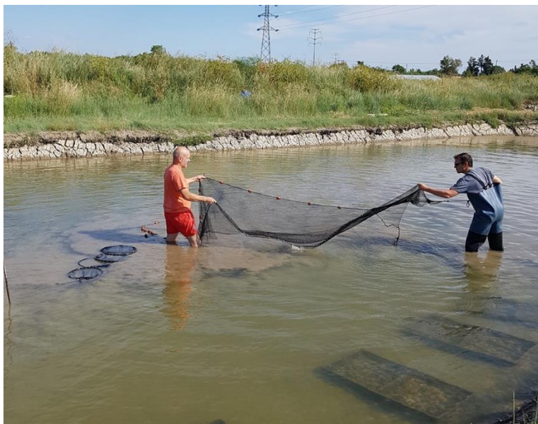
Figure 6: Detail of fish capture at LML.

The main complication for the production system is related to the implementation of the different species, based on their specificity, and thus the organization of the start-up of the system (dry period, temperature, and filtration of water for shrimps, nets on wet mud for clams). This difficulty is aggravated by the fact that, for most species (oysters, clams, shrimps), the supply comes from extensive farms and therefore has an uncertain and variable delivery date. In addition, the water supply must take account of the tides. An improvement in management would be the possibility of temporarily storing the species in dedicated structures according to their arrival date, so that when they are fully available, they can be introduced into the system according to the planned sequence. An alternative strategy, albeit more complex and later to implement, would be to introduce a collateral system for the domestic production of juvenile mussels and shrimps.