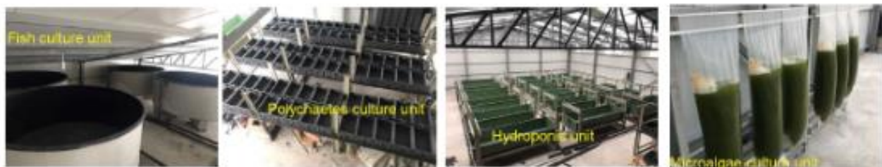
Figure 2: Main compartments of the SIMTAP system implemented at MEDFRI in Turkey.