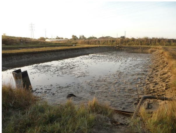
Figure 7: View of one of the SIMTAP system ponds during system downtime at LML.

Another point concerns the management of the water cycle and the need to ensure a sufficient supply of oxygen for the sea bream. In this regard, there were initial concerns about the ability of sea bream to tolerate very low dissolved oxygen levels, depending on the time of day (i.e., phytoplankton photosynthesis). However, sea breams shown to survive at oxygen levels considered lethal (<3 ppm), which in any case should be avoided and therefore air-lift systems have been installed to deal with potential crises. It is recommended that sea bream be stocked in good conditions well before the critical periods (late summer) so that they can adapt before the period of high heat.