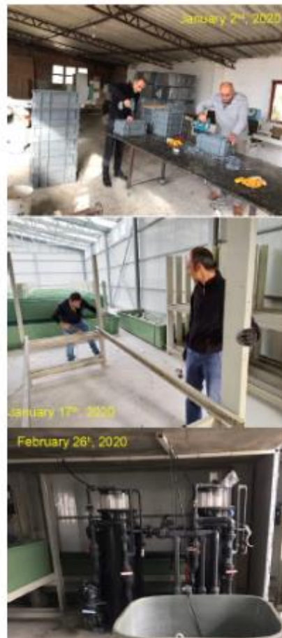
Figure 1: Construction of the greenhouse that hosted the SIMTAP system at MEDFRI in Turkey, and its main components.